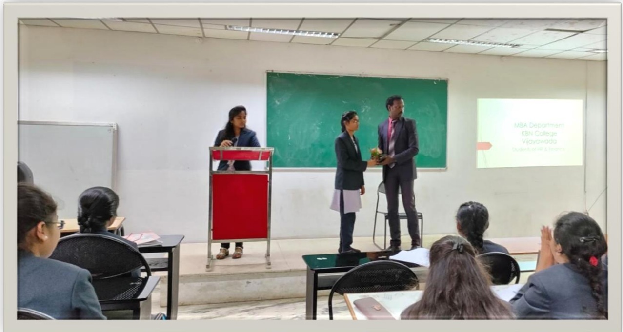
PHOTO GALLERY OF THE ROLE OF HR IN 21 st CENTURY